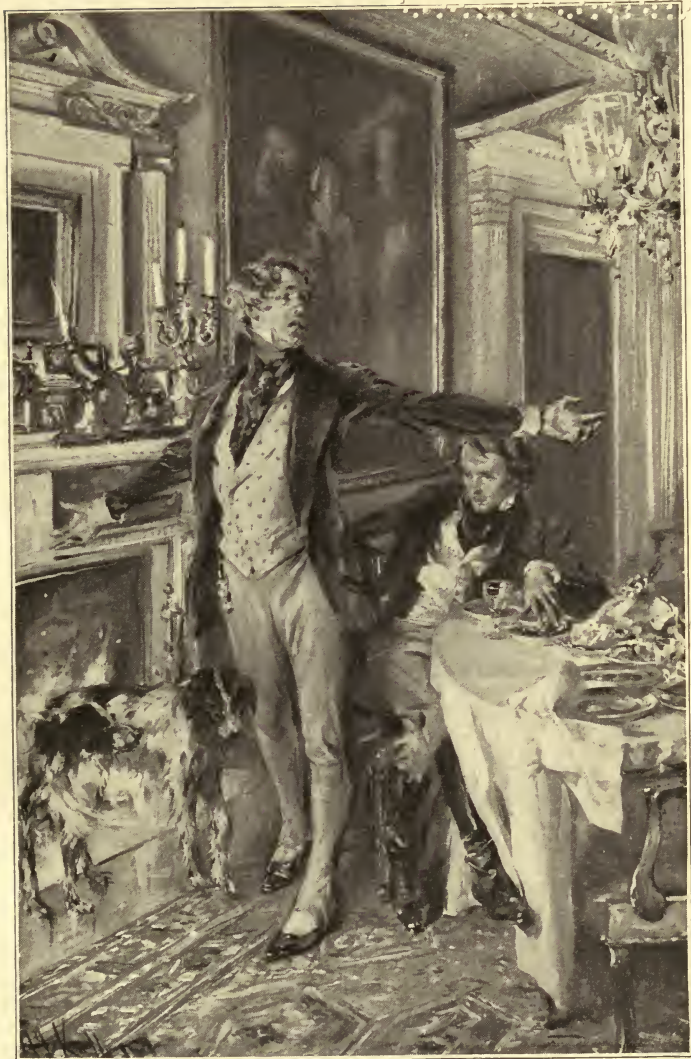
So far the young fellow had not moved nor offered a word in defence